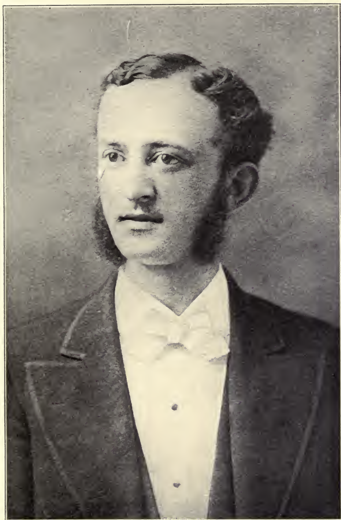
OSCAR S. STRAUS At the time of his graduation